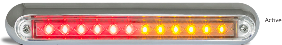
Stop/Tail/Indicator 235CWST112 - Single Bulk