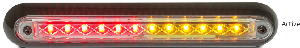
Stop/Tail/Indicator 235BBST112/2 - Twin Blister